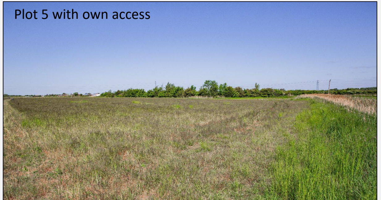
Plot 5 with own access