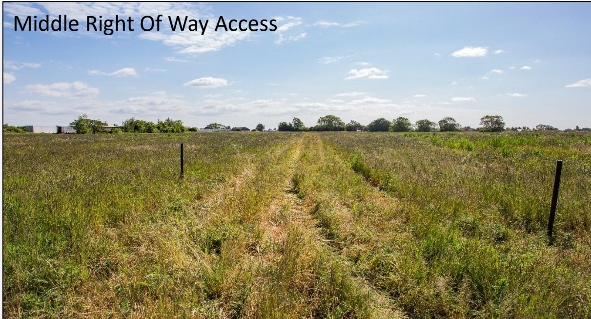
Middle Right Of Way Access