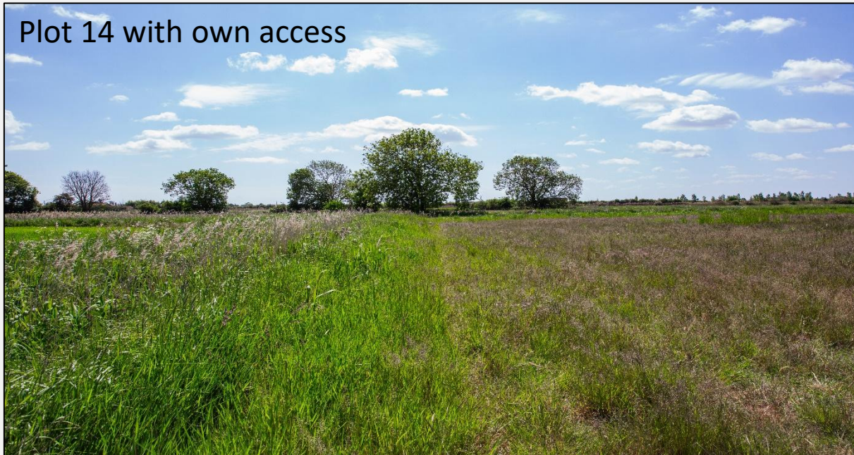
Plot 14 with own access