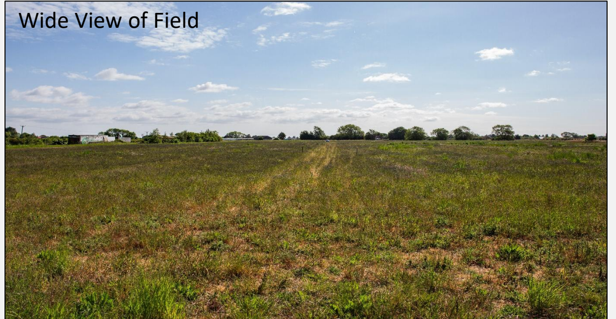
Wide View of Field