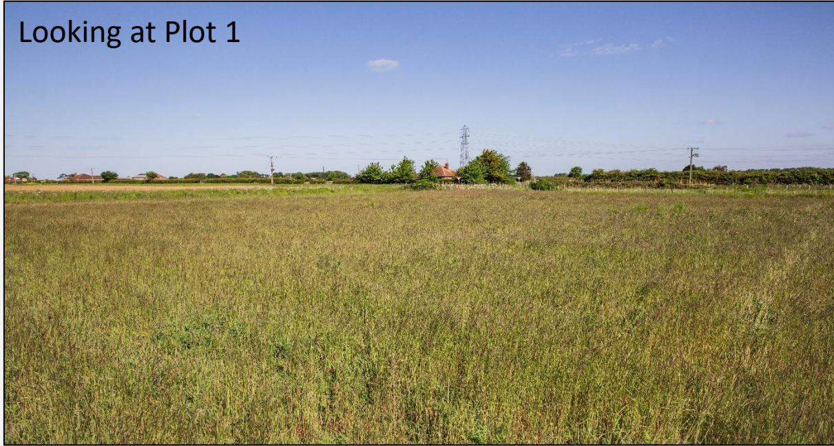
Looking at Plot 1